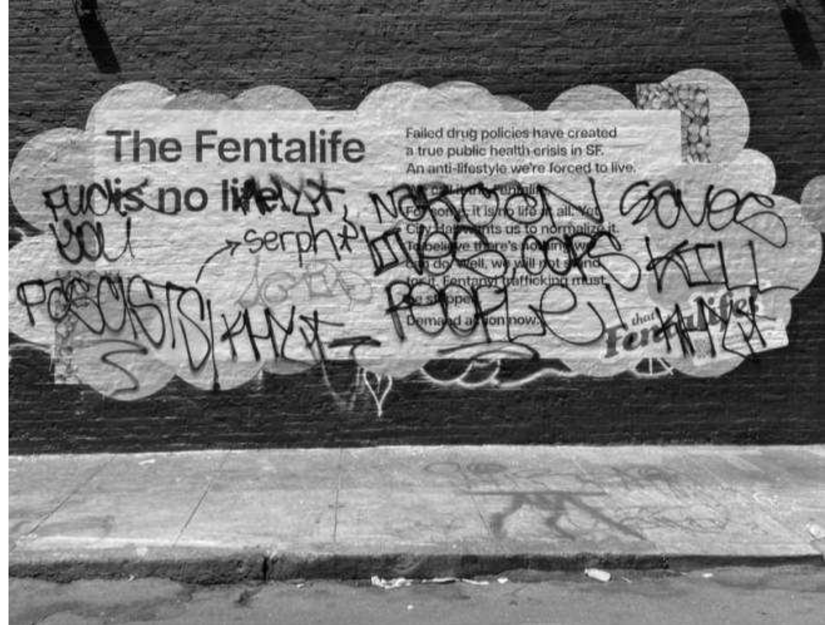
Graffiti reads, “Narcans Saves Lives, Cops Kill People!” “Fuck Your Fascists!”

Rising rents, flattening wages, and cuts to social services – policies backed by the billionaire class of both parties have led to the current crisis in San Francisco, a situation which has only worsened since the pandemic. These are the same factors pushing out working and middle-class workers from urban cores, which in turn are causing the closure of many retail stores, like Walgreens. Increased police repression and “law and order” policies won’t address any of these problems, which in turn are feeding the growing mental health and drug overdose crises.